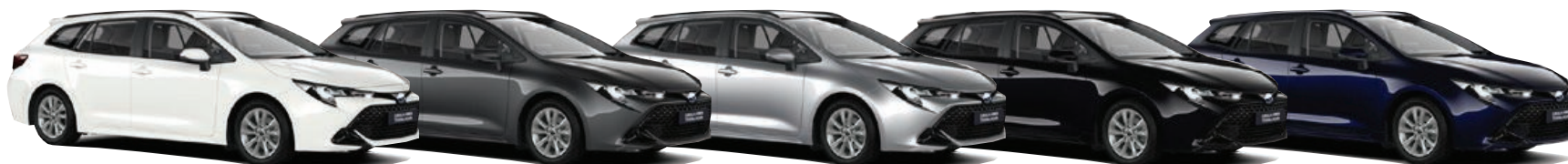
Pure White (040)