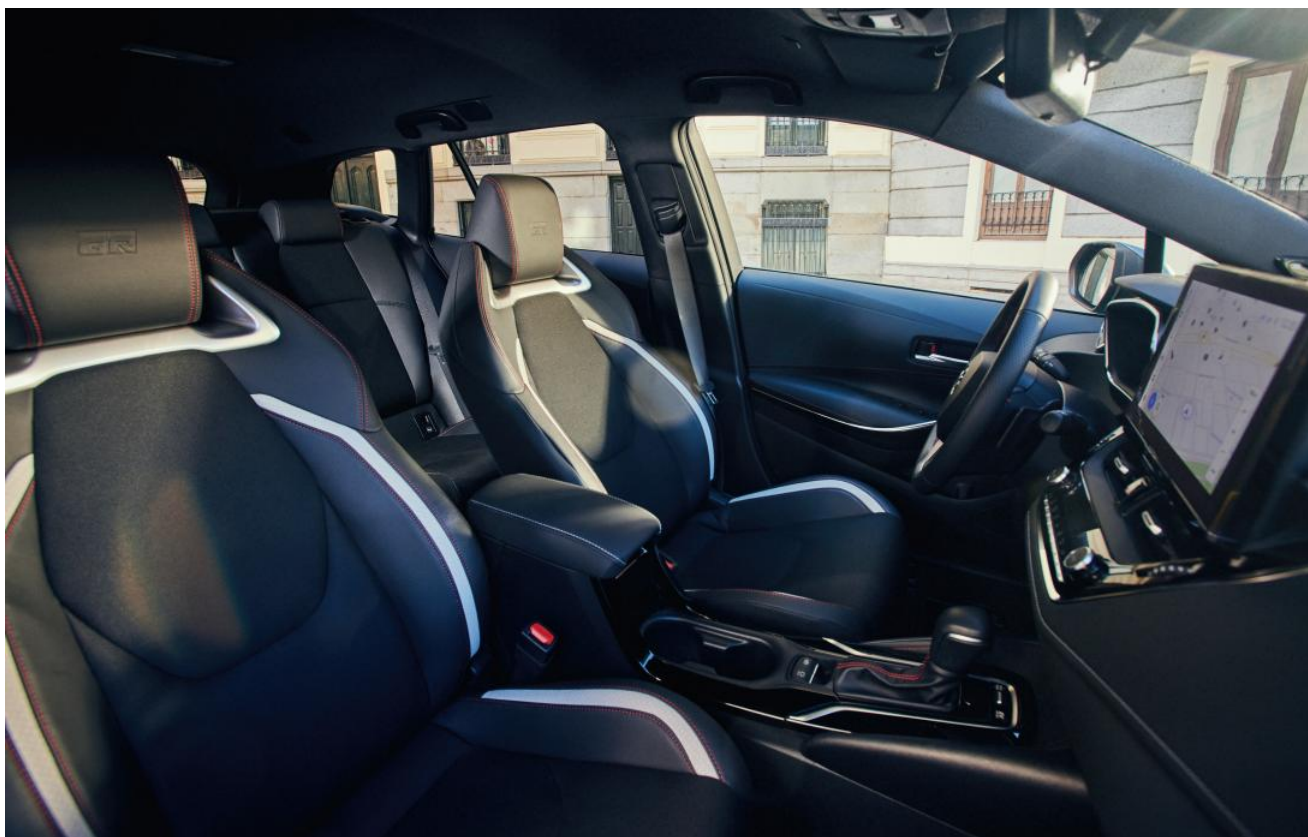
Black Fabric with Grey Stitching (Luna) Black Partial Synthetic Leather Upholstery (Sol & GR SPORT)