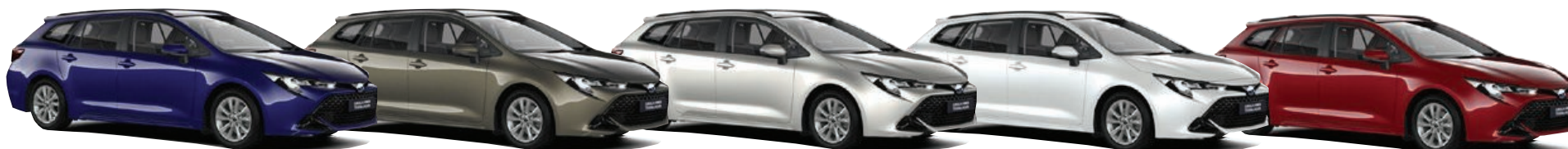
Juniper Blue (8Y8)