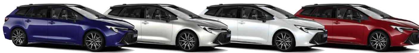
Juniper Blue Bi-tone (2VL)