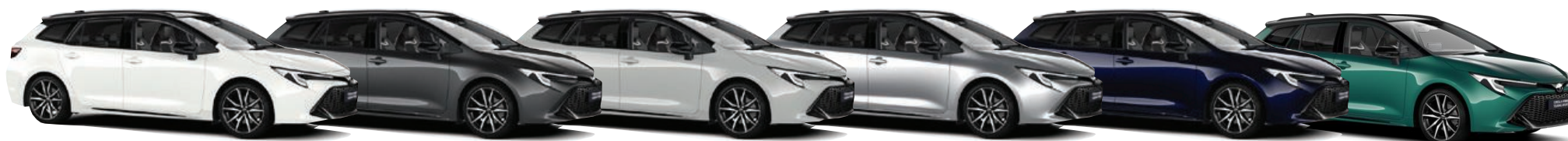
Pure White Bi-tone (2NR)