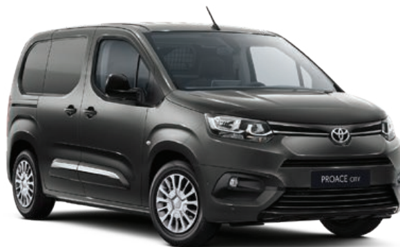
Dark Grey (EVL)