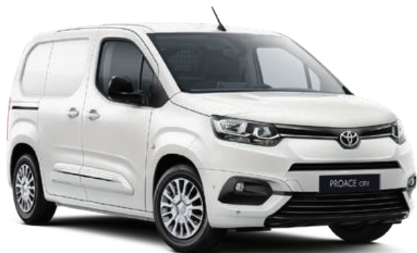
Icy White (EPR)